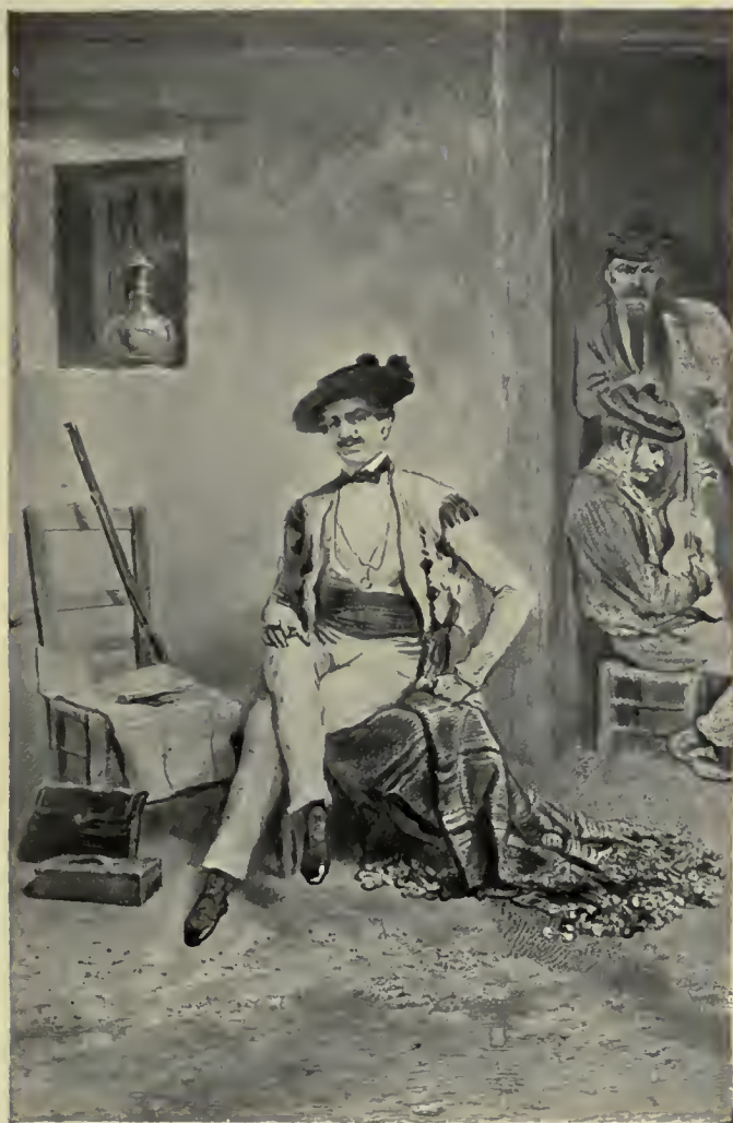
ANATOLE DEMIDOFF, Prince of San Donato.